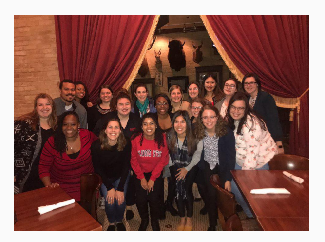
National Association of Student Personnel Administrators (NASPA) IV-E Conference, Milwaukee, WI